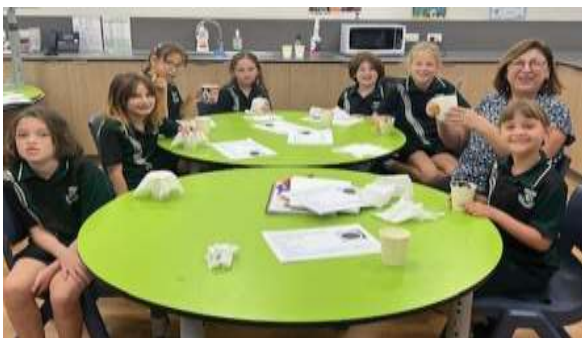
Girls Group Having Fun Cooking