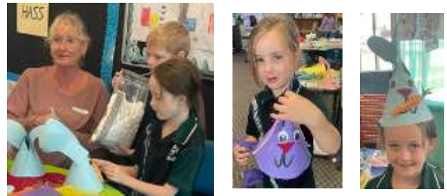
2B Working Hard on Easter Hats