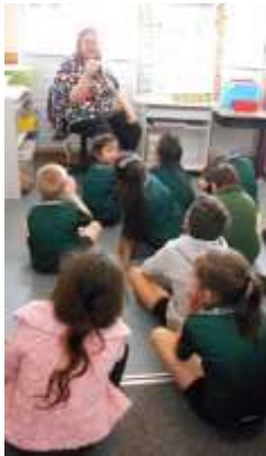
1/2C Being Learners