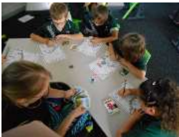
3B Literacy Activities